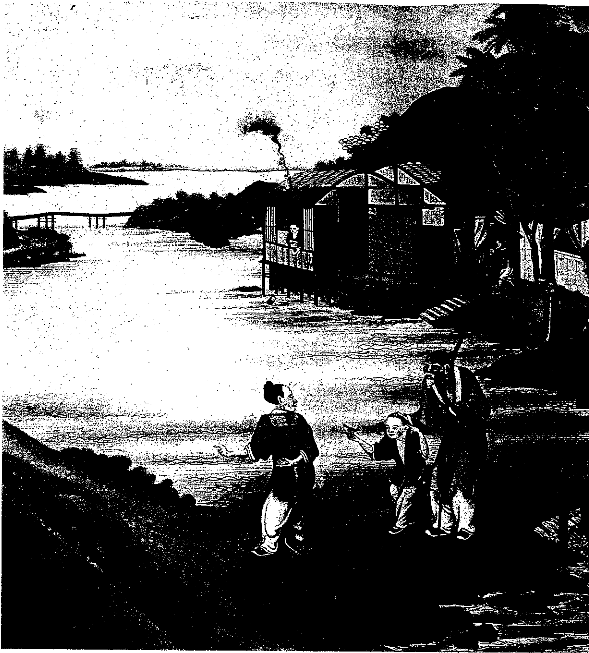
River Scene, 18th century. China. Free Library, Philadelphia, PA.

footsteps near his head. He woke instantly and looked about, but he only saw the brightly colored centipede.