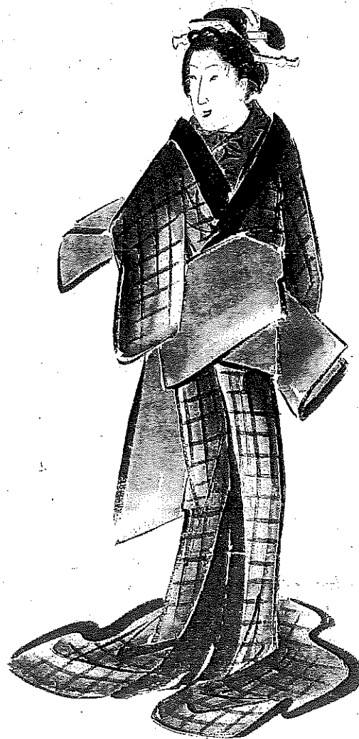
Standing Beauty , 1851. Ando Hiroshige. Hanging scroll, ink and color on paper, 91.5 x 27.7 cm. The British Museum, London.

"Do not worry, my son," she answered gently. "I am just marking the way so you will not get lost returning to the village."