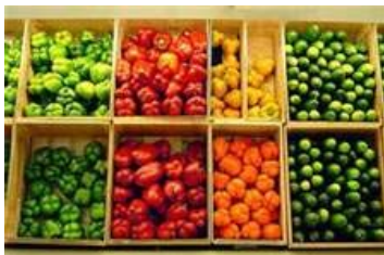
Families can visit a local farmer's market to purchase fresh fruits and vegetables.